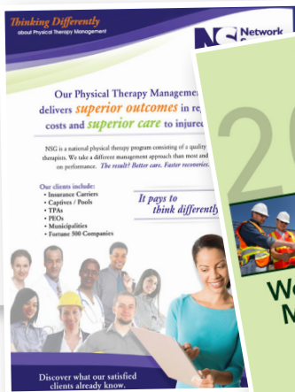
Example Back Cover Ad