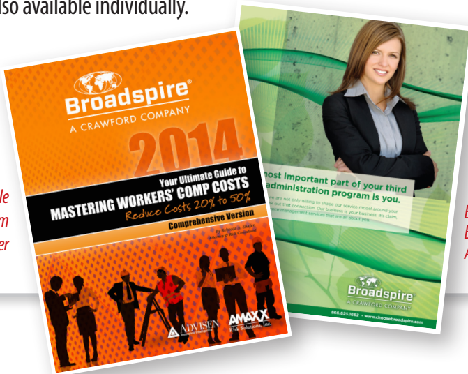
Example Custom Cover